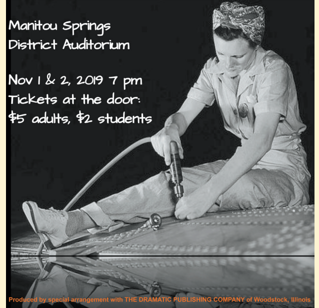
Produced by special arrangement with THE DRAMATIC PUBLISHING COMPANY of Woodstock, Illinois

Nov 1 & 2, 2019 7 pm Tickets at the door: $5 adults, $2 students